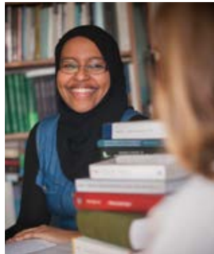
*according to The Complete University Guide 2017